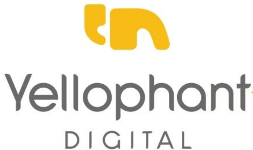
IMAGE D: Logo for Yellophant digital advertising agency Seth, P. 2020. Yellophant digital logo